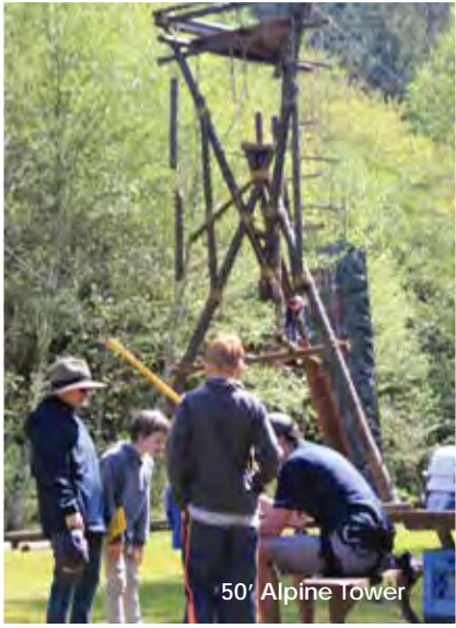
50' Alpine Tower