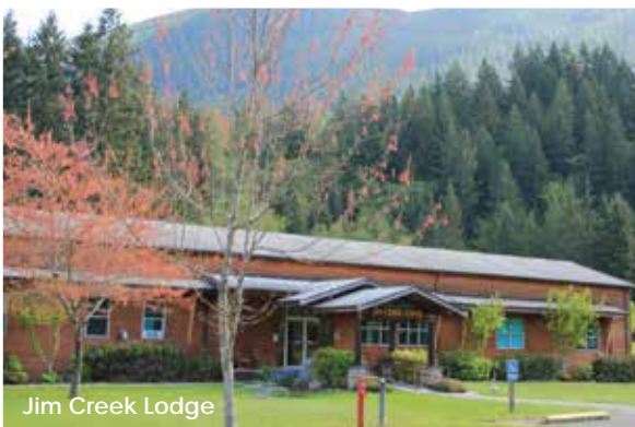
Jim Creek Lodge

21027 Jim Creek Road Arlington, WA 98223-8599 (425) 304-5315/5363